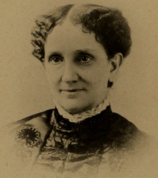
MARY BAKER G. EDDY,

The Discoverer and Founder of Christian Science.